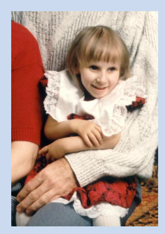
FIG. 1. Patient 1 (here, 5 years, 11 months), severe/borderline moderate. "She was a living example of unconditional love who touched everyone she met." [Color figure can be viewed in the online issue, which is available at wileyonlinelibrary.com]

Gross motor skills. Of 14 surveyed children in this group, 10 were unable to sit without support and one could sit for 1–2 min with careful supervision. The other could sit independently, though this skill was lost as the syndrome progressed. Severe flexion contractures were cited as a major barrier to sitting. No child in this group was able to walk independently. Parents and medical records cited upper body weakness and contractures as factors inhibiting gross motor skill development. Kyphosis was reported in