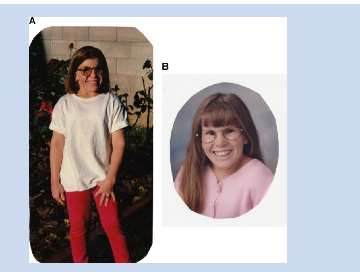
FIG. 2. Patient 2, very mild. A: 18 years and B: 21 years. This individual was never cachectic and inadequate food intake was never a problem for her. Tooth extraction and braces reduced malocclusion. "She loved to swim, ride bikes, take walks, and shop. She would tell everyone 'I was born to shop'." [Color figure can be viewed in the online issue, which is available at wileyonlinelibrary.com]

Medical records for one person indicated earlier-than-average walking at 12 months, though most in the survey or the literature walked in the late-normal range [Hamdani et al., 2000; Rapin et al., 2006]. Seven survey subjects acquired advanced gross motor skills such as riding a bicycle without training wheels, skiing independently, or swimming a stroke independently.